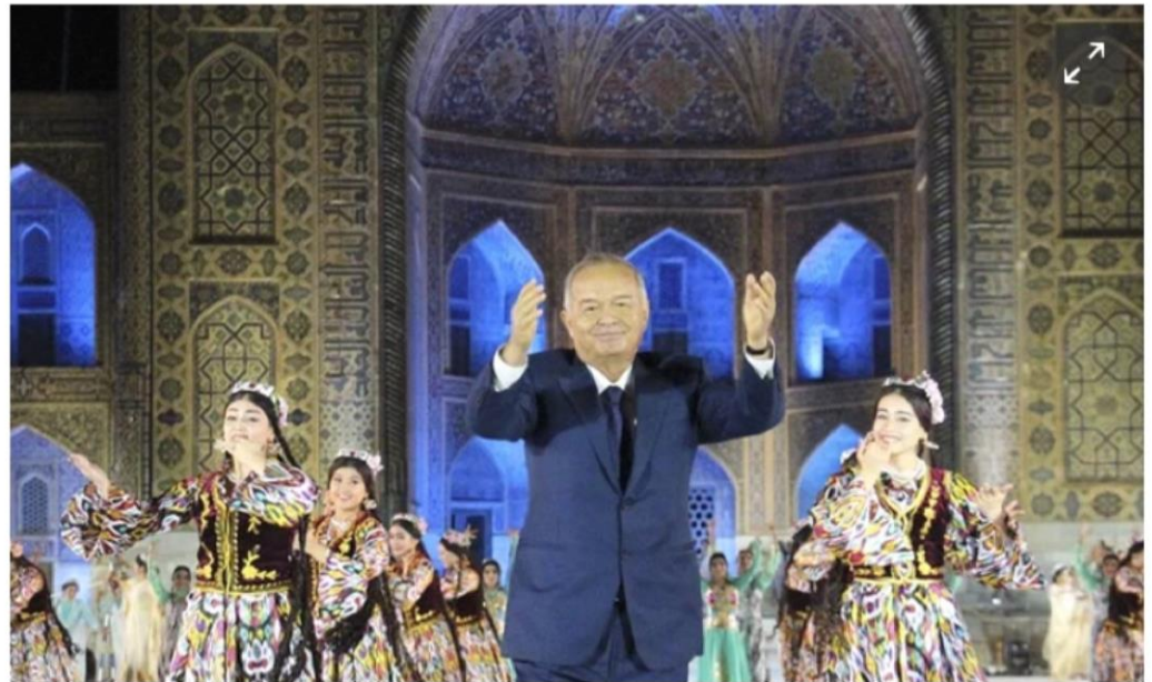
Uzbekistan's President Karimov in Samarkand.

Repressive central Asian regime recalls Soviet era by outlawing what it calls 'western pseudo-science'